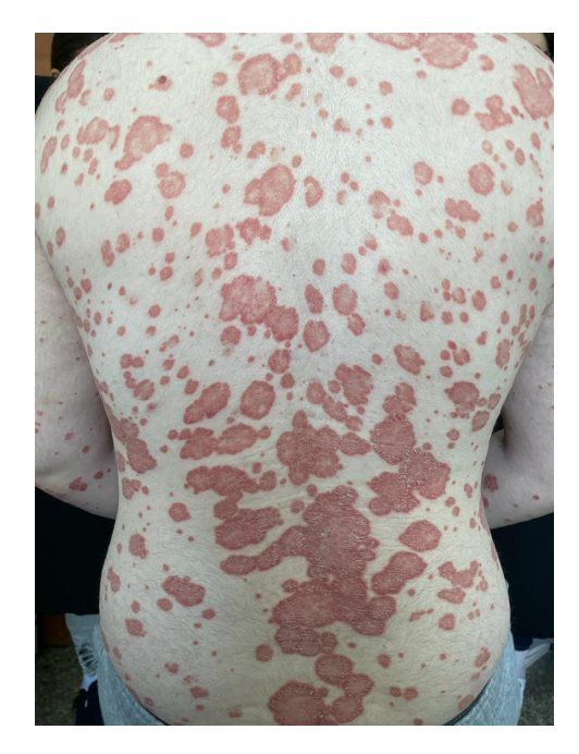
Figure 3. Chronic plaque psoriasis with extensive skin involvement on the posterior trunk and on the upper limbs.