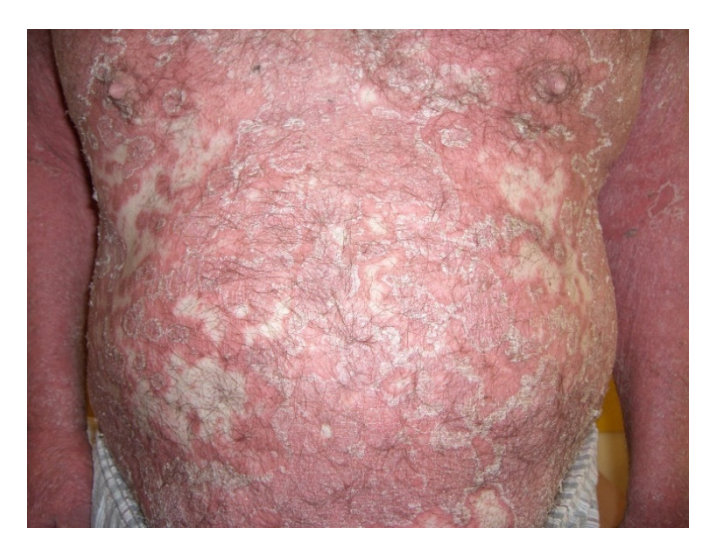
Figure 4. Erythrodermic psoriasis: widespread, confluent erythema with marked scaling and exfoliation on the trunk as well as the upper limbs.