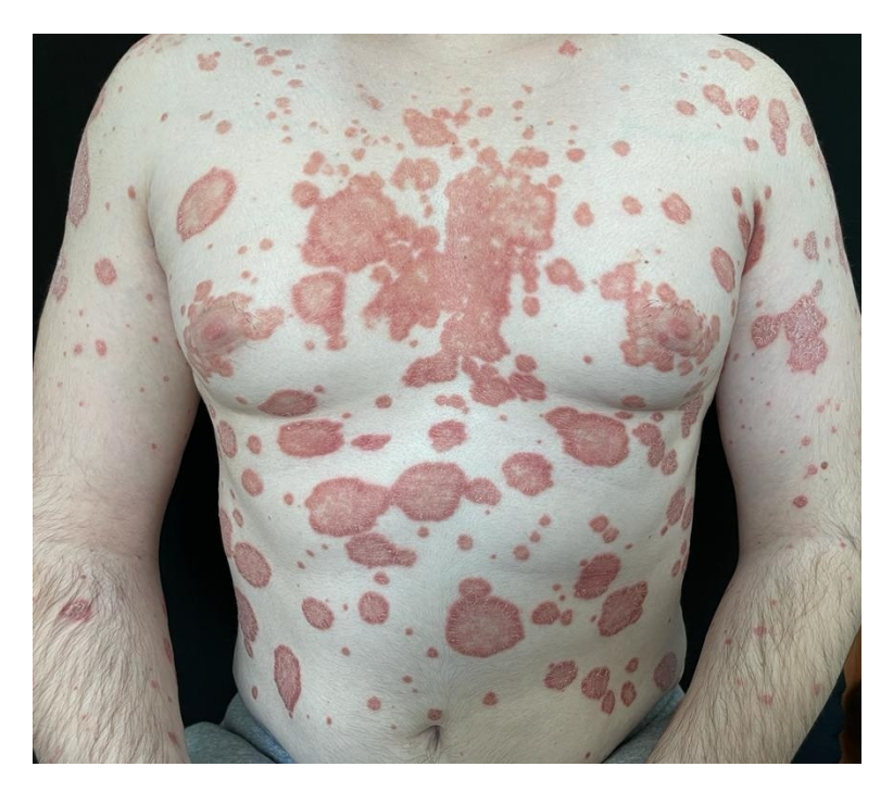
Figure 2. Chronic plaque psoriasis with extensive skin involvement on the anterior aspect of the trunk and on the upper limbs.

Figure 1. Round to oval, well-defined psoriasis plaque on the left elbow covered by a thick, silvery scale. Several smaller plaques may also be seen on the trunk.