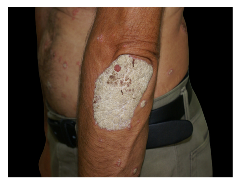
Figure 1. Round to oval, well-defined psoriasis plaque on the left elbow covered by a thick, silvery scale. Several smaller plaques may also be seen on the trunk.

silvery scale predominantly on the elbows, knees, lumbar region, and scalp (Figure 1), with the possibility of extensive involvement of the skin (Figures 2 and 3) [2]. The most common morphologic variant of psoriasis is chronic plaque psoriasis, which accounts for up to 80% of cases; however, more severe clinical presentations, such as the erythrodermic variant, may be seen as well (Figure 4) [3]. Psoriasis not only affects the skin, but also the nails and joints [4]. At the present moment, it is well-recognized that psoriasis is associated with a plethora of comorbidities including metabolic syndrome, cardiovascular disease, hypertension, diabetes, hyperlipidemia, obesity, anxiety, depression, chronic kidney disease, and malignancy [4,5].