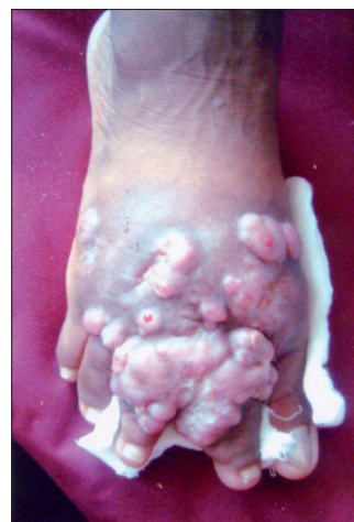
Figure 1: Photograph of lesion

The histopathological examination of biopsy revealed structure of skin, sub-cutaneous tissue and sinus tract lined by granulation tissue. Few irregular lobulated light basophilic granules were present. The granules are not bordered at the periphery by the eosinophilic material; the filaments in the granules are weak acid fast giving an impression of multiple discharging sinuses of foot – Actinomycetes Mycetoma – Nocardia species.