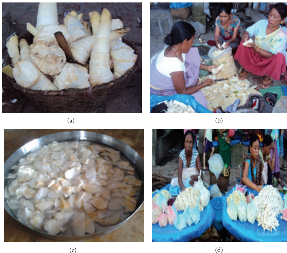
FIGURE 3: Production of traditional bamboo shoot foods. (a) The newly harvested bamboo shoots after removing the outer sheaths, (b) bamboo shoots chopped into fine pieces to make ushoi , (c) bamboo shoot pieces are treated in water before being utilised as food, and (d) fermented bamboo shoots sold in the market as vegetable.

of daily cuisine as it adds ethnic flavour and aroma to the curries.