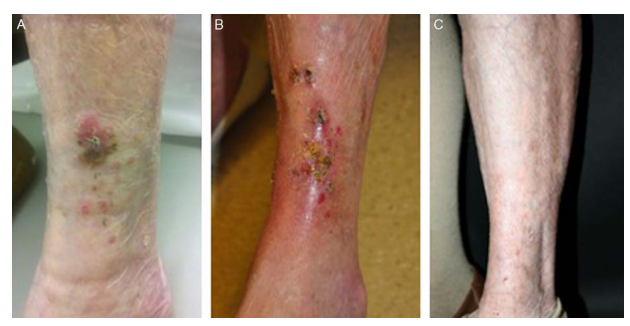
FIGURE 1. Patient 1's response. A, Primary lesion is a 2 \times 2 cm dark brown plaque on the anterior left lower leg that had enlarged and become hypopigmented. Several 3–4 mm nonpigmented pink nodules appeared at lateral and inferior sites to the primary lesion. B, After several months of imiquimod topical therapy, all lesions developed variable degrees of inflammation and crusting. C, Almost 3 years after discontinuation of all therapy, the patient remained disease free.

Five weeks later, the primary lesion lost all pigment, however, 2 nonpigmented papules persisted, and a new erythematous papule at the inferior aspect of the in-transit field was biopsied and showed persistent melanoma. Upon reconsidering the options, the patient's family opted for topical therapy. After 1 month of applying imiquimod 5% cream every other night, a new nodular plaque and a pink papule appeared, thus application was increased to nightly. The nodules then developed variable degrees of inflammation and crusting (Fig. 1B), followed by flattening and fading. With good response after 7 months of nightly therapy, the patient switched to 1 application every 2-3 days. In total, the patient received 3 BCG injections (1 initial sensitization and 2 ILBCG) and imiquimod for 34 weeks of active management and 28 weeks of maintenance therapy. Therapy was discontinued 6 months later, and 3 years and 11 months later, she remained disease free (Fig. 1C), eventually expiring from a small bowel obstruction unrelated to her melanoma.