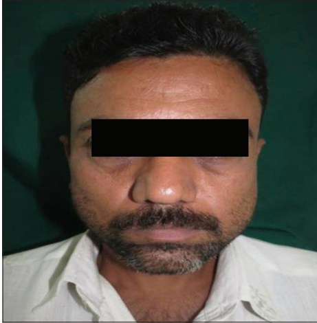
Figure 2: Clinical picture of the swelling in lower left posterior region, diagnosed as benign odontogenic tumor

The ultrasonographic features of various lesions were summarized [Table 5].