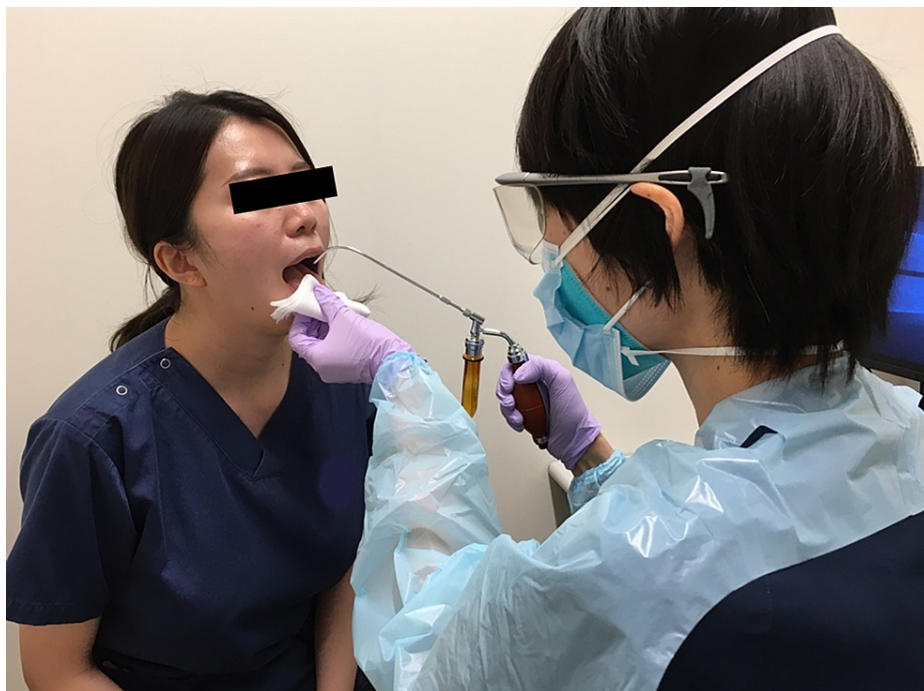
FIGURE 2: Throat anesthesia using Jackson's spray

Five milliliters of 4% lidocaine was administered face-to-face prior to bronchoscopy.