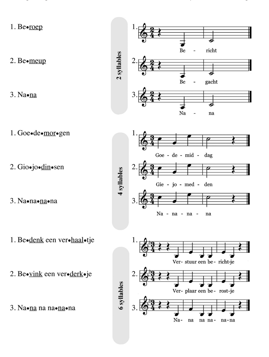
Figure 1. Stimulus examples (in Dutch) of the two experimental conditions. Spoken stimuli (left side of the figure): words are separated into syllables with a black dot. Syllables that are underlined are stressed. Melodically intoned stimuli (right side of the figure): musical notation of the stimulus. In each condition there are three types of stimuli: (1) meaningful, (2) meaningless, and (3) neutral utterances. Provided are examples of words with two and four syllables, and of short phrases of six syllables. Approximately J = 120.

The experiment was conducted in an event-related design consisting of four experimental conditions and two control conditions. The stimuli in the experimental conditions consisted of 30 melodically intoned meaning-