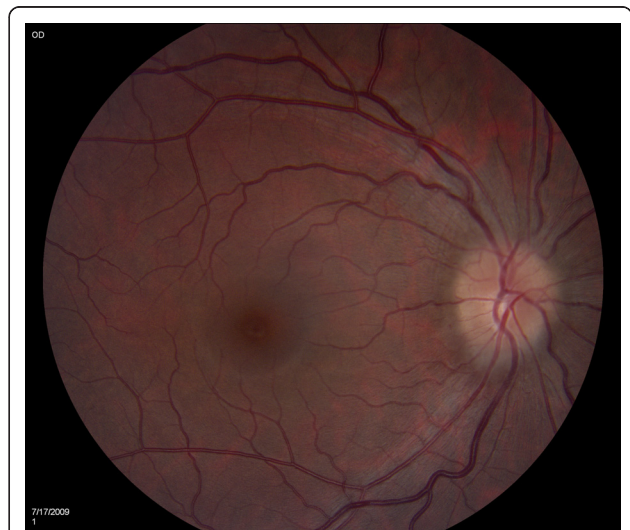
Figure 2 Resolution of papilledema after the withdrawal of ciprofloxacin.