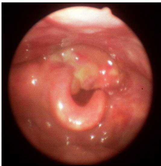
Fig. 1 Fiberoptic laryngoscopy disclosed a large hypopharyngeal tumor with a critical airway

(3,400/mm 3 ) and thrombocytopenia (86,000/mm 3 ), and biochemistry analysis showed hypoalbuminemia (3.2 g/dL), hyperbilirubinemia (total bilirubin 1.77 mg/dL), elevated aspartate aminotransferase (AST) (80 U/L) and normal alanine aminotransferase (ALT) (40 U/L). Prothrombin time and activated partial thromboplastin time were within normal limits. C-reactive protein (CRP) was 4.12 mg/dL (reference 0–0.5 mg/dL). A computed tomography (CT) scan revealed an increased amount of soft tissue at the right pyriform sinus with a maximal diameter of 5.6 cm, compatible with hypopharyngeal cancer (Fig. 2). Tracheostomy was performed to establish an adequate airway, and a tumor biopsy was performed via direct laryngoscopy. However, the pathology report of the