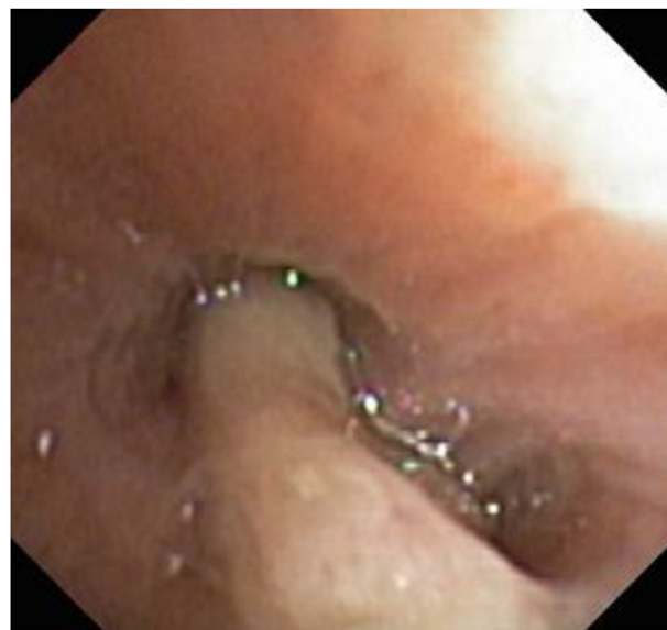
Fig. 2. Bronchial mucus cast observed on flexible bronchoscopy in Case 1.

A previously healthy 6-year-old male was admitted to an outlying hospital with diagnosis of ruptured appendix. Exploratory laparotomy and appendectomy were performed by pediatric surgical team, without any immediate complications. On postoperative day 3, he developed respiratory distress and hypoxia. Chest X-ray revealed alveolar opacities in the right upper and left lower lobes. At this point he was transferred to the general pediatric floor at our facility. Examination on arrival revealed respiratory distress, with oxygen saturations of 97% on 2L/minute of supplemental oxygen through a nasal cannula. Nasogastric