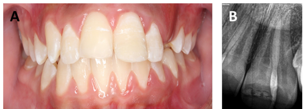
FIGURE 3: Post-operative follow-up images at 15 months. (A)

Again, follow-up examinations were carried out at a 15-month interval, and the tooth was functioning normally and esthetic was pleasing (Figure 3). The difference in shade had become unnoticeable.