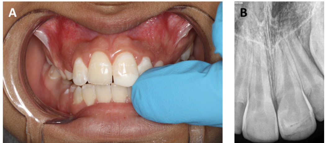
FIGURE 2: Post-operative image and radiograph. (A) Reattachment of the broken tooth fragment in the maxillary central incisor. (B) Peri-apical radiograph immediately after the attachment of the broken fragment.