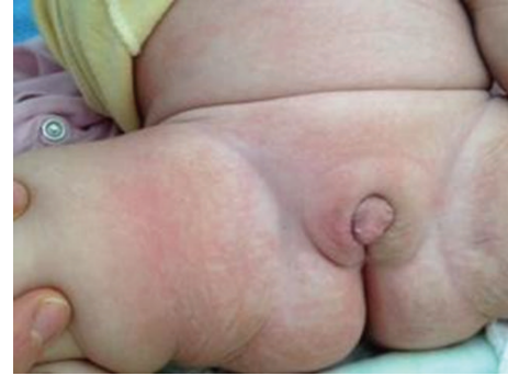
FIGURE 3: Regression of the phallus at the 7th month of the hormone replacement treatment (constructive operation has not yet been performed).

The patient's general status, vitals, feeding tolerance, glucose, and electrolyte levels were followed up carefully. On the 4th day, hypoactivity, poor feeding, and vomiting commenced. Electrolytes were suggesting salt waste. We stopped enteral feeding and before starting treatment we obtained blood samples for hormone tests. Fluid and electrolyte replacement began with saline and dextrose solutions (150 mL/kg/day, 100 mEq/L Na, and 10% dextrose). At the time, only methyl-prednisolone was available for an intravenous injection. At the beginning of the treatment we administered 5 mg of methyl-prednisolone and continued with divided equal doses every eight hours. Fludrocortisone was given (0.2 mg/day) for mineralocorticoid replacement. We also had to give 1 mg/day of table salt for a few days. On the 5th day, the patient's general appearance was better, vitals were normal, vomiting stopped, and electrolytes were improving. On the 6th day, feeding was well tolerated and electrolytes were normal. The amount of intravenous fluid and the dose of glucocorticoid treatment were reduced and continued with hydrocortisone tablets. Although the management of adrenal insufficiency was working properly, oliguria and declined renal functions occurred on the 7th day. Urine output was below 0.5 mL/kg/hr and creatinine level was 1.6 mg/dL. Physical examination revealed a "globe vesical,"