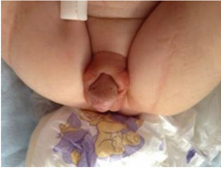
FIGURE 1: The external genitalia appeared to be significantly virilised (Prader stage 3).