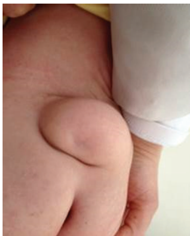
FIGURE 2: The meningomyelocele in the sacral area.

The patient's general status, vitals, feeding tolerance, glucose, and electrolyte levels were followed up carefully. On the 4th day, hypoactivity, poor feeding, and vomiting commenced. Electrolytes were suggesting salt waste. We stopped enteral feeding and before starting treatment we obtained blood samples for hormone tests. Fluid and electrolyte replacement began with saline and dextrose solutions (150 mL/kg/day, 100 mEq/L Na, and 10% dextrose). At the time, only methyl-prednisolone was available for an intravenous injection. At the beginning of the treatment we administered 5 mg of methyl-prednisolone and continued with divided equal doses every eight hours. Fludrocortisone was given (0.2 mg/day) for mineralocorticoid replacement. We also had to give 1 mg/day of table salt for a few days. On the 5th day, the patient's general appearance was better, vitals were normal, vomiting stopped, and electrolytes were improving. On the 6th day, feeding was well tolerated and electrolytes were normal. The amount of intravenous fluid and the dose of glucocorticoid treatment were reduced and continued with hydrocortisone tablets. Although the management of adrenal insufficiency was working properly, oliguria and declined renal functions occurred on the 7th day. Urine output was below 0.5 mL/kg/hr and creatinine level was 1.6 mg/dL. Physical examination revealed a "globe vesical,"