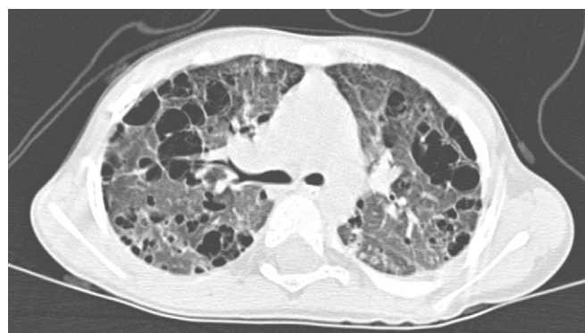
Fig. 3. High resolution CT. Diffuse bilateral cysts of varying size and wall thickness.

The patient was treated following the LCH-III protocol (Histiocyte Society) with Vinblastin and Prednison. After six weeks, the patient responded well to chemotherapy at the first course evaluation. Nail and skin abnormalities improved, and chest CT remained stable. Bronchoalveolar lavage at 12 weeks treatment showed less