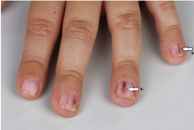
Fig. 4. Detailed photograph of the nails of the patient, showing onycholysis (a) and splinter hemorrhages (b) of the nails.

disease LCH patients, the clinical presentation is nonspecific and usually does not predominate. The nail abnormalities are consistent with LCH, although uncommon.