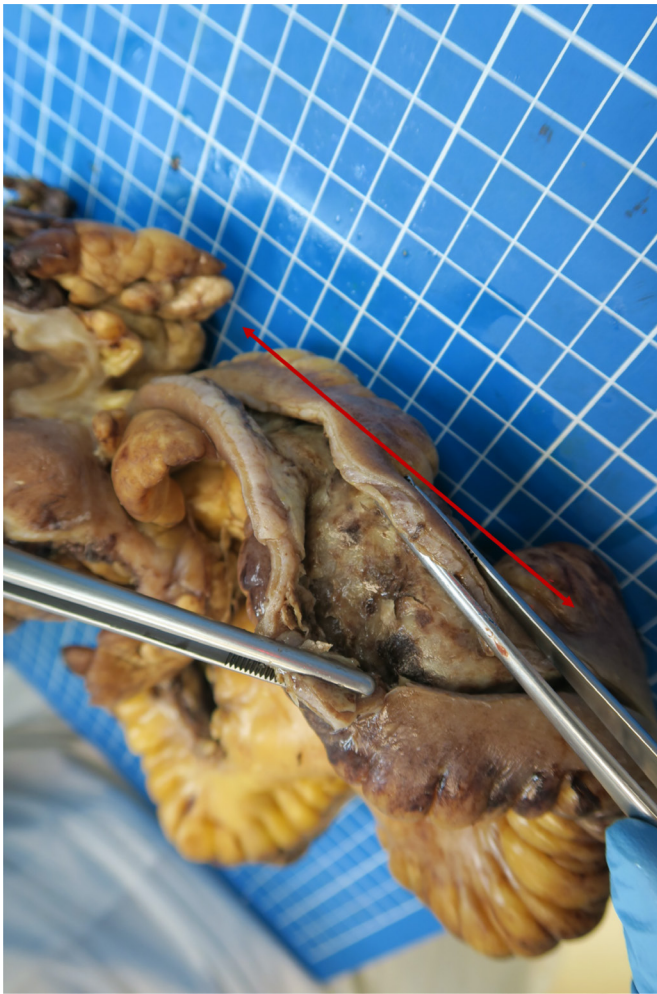
Figure 1 Distal terminal ileum ulceration involving a 30 cm segment (red arrow).

There was colitis of the caecum and ascending colon (<50% of segment) with large ulcerations (<10% of segment). Due to failure of endostasis, a right-sided hemicolectomy and segmental resection of the terminal ileum was performed. Gross examination shows extensive ulceration of the distal 30 cm segment of the terminal ileum associated with thickened dusky wall, fat encroachment and mesenteric stranding (figure 1). The caecum showed three deep linear circumferential ulcers with associated bowel wall perforation. Microscopic examination revealed extensive ulceration of the terminal ileum and deep fissuring ulceration of the caecum associated with perforation. The mucosa at the ulcer edges showed irregular, branching and disordered crypts, compatible with regenerative changes. Apart from foreign material from prior embolisation attempts, there were no thrombi within the large vessels. Smaller vessels around ulcerative sites contained scattered fibrin microthrombi but the overall burden was low, and no ischaemic changes were observed. No features of severe ischaemic colitis, transmural lymphoid aggregates, viral inclusions, granulomas, parasites or vasculitic changes were found (figure 2).