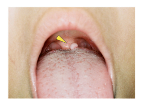
Figure 1. Clinical appearance. Intraoral view showing a swelling of the left lingual mucosa (arrowhead). The pedunculated mass was covered with normal mucosa.

In clinical findings, osseous choristomas are observed as either a sessile or a pedunculated mass (2). The clinical differential diagnosis includes other tumor-like lesions, such as salivary gland tumors, fibromas, lipomas, neural tumors, giant cell tumors, and soft tissue cysts (4,5). If soft tissue calcification and bone formation are observed, the differential diagnosis should include teratomas, osteomas, calcified lymph nodes, osseous hamartoma, calcified hamartomas