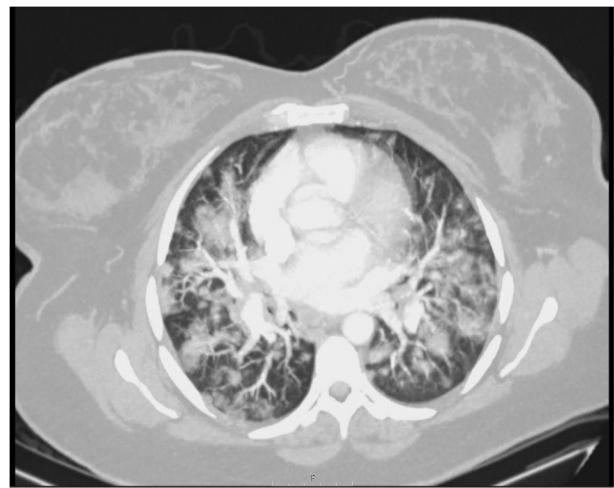
Figure 2. Chest computerized tomography showing extensive severe bilateral focal ground-glass infiltrates typical characteristics of COVID-19 (axial view).

Despite there being a considerable number of pregnant women diagnosed with COVID-19