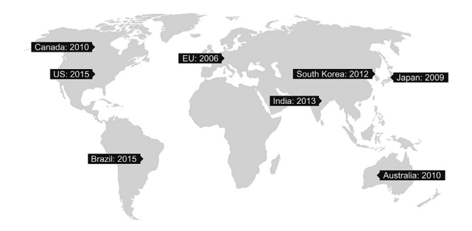
FIGURE 1 Evolution of the biosimilars regulatory landscape across the globe (Krishnan et al., 2015; WHO, 2016)

The development pathway of an originator biologic requires extensive clinical evaluations, with the ultimate aim of establishing superiority (vs. placebo or comparator agents) in terms of efficacy and an adequate safety profile. In contrast, the pathway for biosimilar development is to demonstrate similarity to the reference product with respect to quality, safety, and efficacy using a stepwise approach that includes analytical, nonclinical, and clinical studies, rather than establish de novo safety and efficacy (FDA, 2015b) (Figure 2).