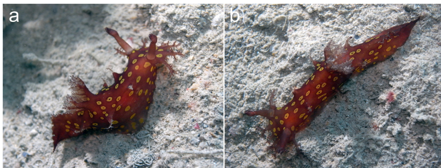
FIG. 1. A pair of the “rare” nudibranch Plocamopherus ocellatus observed in the Red Sea (Saudi Arabia), Farasan Banks, east side of Safiq Island. (a) One individual (~20 mm long) is contracted; (b) the other one (~30 mm long) is extended. Both were crawling together on sand at 27 m depth (5 May 2017) and observed by B. W. Hoeksema during scuba diving.

The nudibranch Plocamopherus ocellatus Rüppell & Leuckart, 1828 received increased scientific interest as a Lessepsian migrant when diver observations since the 1980s became the basis for publications (Appendix S1: Table S1). The recent discovery of two small specimens in the Red Sea (Fig. 1) drew attention to the question of whether it was more frequently encountered in the