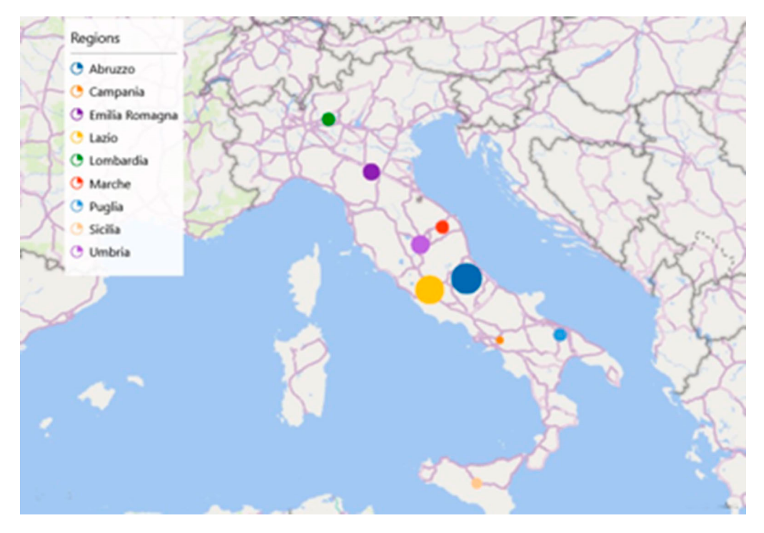
Figure 1. Graphical representation of the distribution of the 54 cases of DTD in Italy.

Participants were recruited between 2016 and 2019 and came from all Italian regions (from North to South, including the Islands) (see Figure 1). Information regarding the survey was basically spread out through social networks, word of mouth and flyers that were distributed in community meeting points, such as local universities, bookshops, cafeterias, public library, and sport clubs. The software Qualtrics (First release: 2005, Provo, Utah, USA, Available at: https://www.qualtrics.com accessed on 23 April 2016)) was used to collect data.