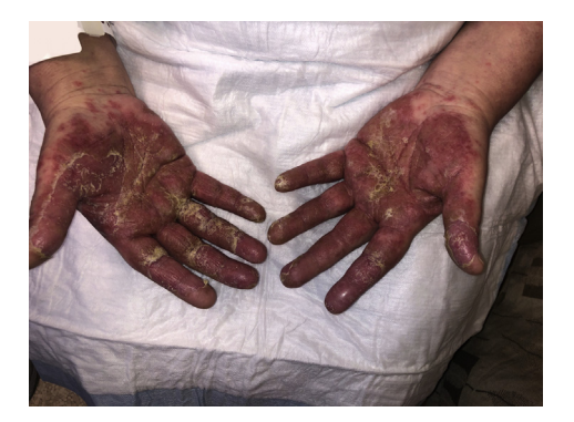
Fig 1. The progression of psoriasis 4 weeks after the resolution of SARS-CoV-2 symptoms, showing palmar erythema with pustules, hyperkeratosis, and desquamation. SARS-CoV-2, Severe acute respiratory syndrome coronavirus 2.