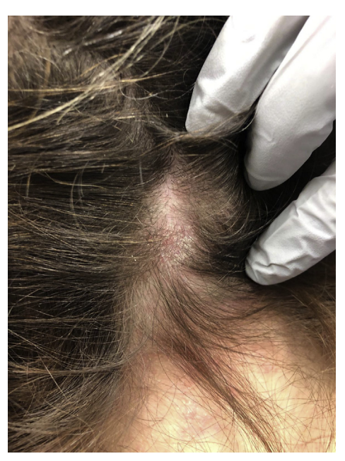
Fig 3. Oval, pink, scaly plaque on the scalp.