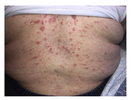
Fig 2. Oval, pink, scaly psoriasiform plaques on the back.

ALT 40/35, alkaline phosphatase 114 BUN/CR 12/ 0.66, negative SARS-CoV-2 rRT-PCR, negative skin pustule culture, and bilateral trace pleural effusions on P-A/lateral chest X-ray.