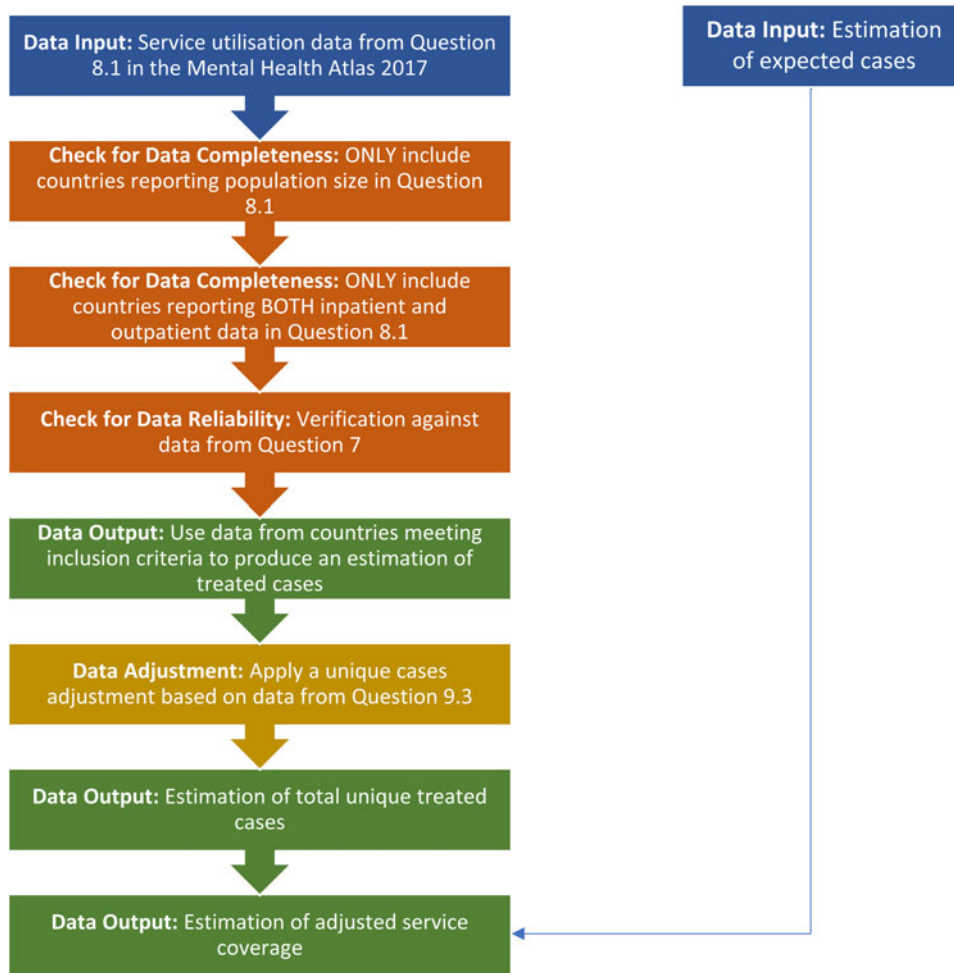
Fig. 1. Flow of data inputs, adjustments and outputs.

and total population sizes. GBD 2016 prevalence estimates were derived by first conducting systematic reviews of the literature to identify studies reporting the prevalence, incidence, remission and/or excess mortality for individual disorders. These estimates were entered in DisMod-MR 2.1 for analysis, a Bayesian meta-regression tool (Flaxman et al. , 2015). If no raw epidemiological data were available for a particular location, data from surrounding locations were used to estimate prevalence. Within DisMod-MR 2.1, regions and super-regions were defined according to GBD 2016's classification of broad geographic regions or continents. Additional information on DisMod-MR 2.1 can be accessed elsewhere (Vos et al. , 2017).