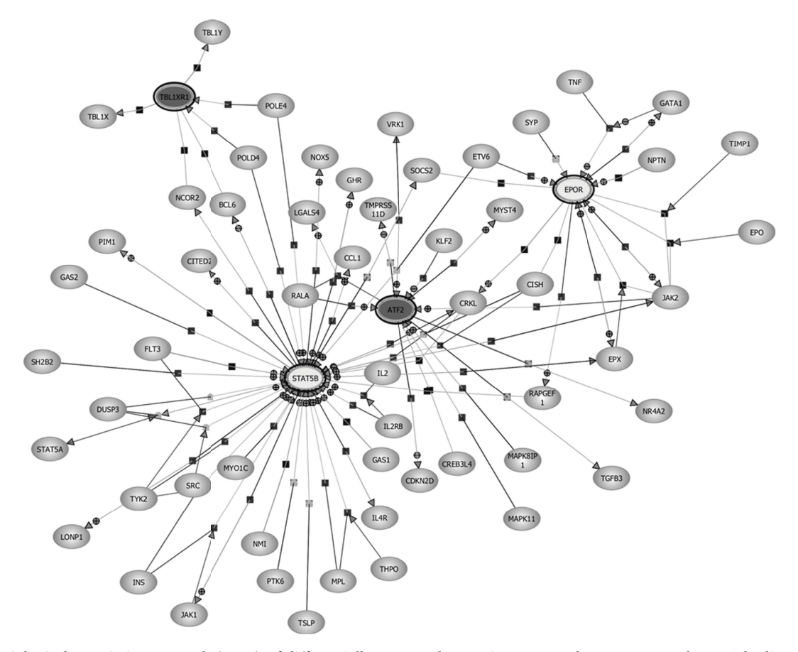
FIGURE 1: Biological association network (BAN) of differentially expressed genes in common between CA and ICC. The list of common genes between both treatments was used to construct a BAN with the Pathway Analysis software within GeneSpring v.11.5.1. An expanded network was constructed by setting an advanced filter that included the categories of binding, expression, metabolism, promoter binding, protein modification, and regulation. Only proteins are represented. The BAN shows the node genes STAT5B and ATF-2 that were further studied.