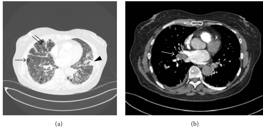
FIGURE 1: (a) Computed tomography scan of the chest, showing widespread pulmonary changes, including multiple thin-walled cystic air spaces (single arrow), scattered foci of consolidation (arrowhead), and interlobular septal thickening (double arrow). Radiologic findings were most suggestive of lymphoid interstitial pneumonia, but lymphoma could not be excluded. (b) Computed tomography scan of the chest demonstrating enlarged hilar nodes.

rearrangement assay testing was performed and demonstrated monoclonal B-cell proliferation, establishing the diagnosis of BALT lymphoma.