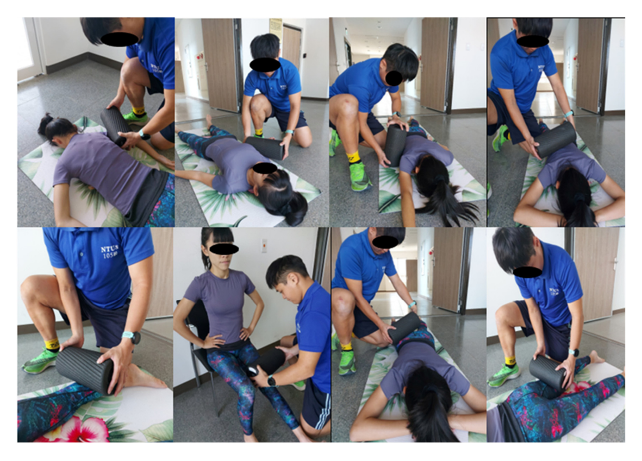
Figure 3. The demonstration of foam rolling (both vibration rolling and nonvibration rolling).

The 5 min walk and one set of 7 min SS were followed by 16 min of passive VFR. For the VFR, a commercial vibration foam roller (Vyper 2.0, Hyperice, Irvine, CA, USA) with a vibration frequency of 48 Hz was used. The VFR was performed passively by a researcher rolling back and forth on the subjects' triceps brachii, biceps brachii, latissimus dorsi, rotator cuff, calf, quadriceps, gluteus, and hamstring muscles. The pressure applied by the researcher on the subjects' body parts was maintained at 2 or 3 on a 10 cm visual analog scale based on the subjects' perception of pressure pain intensity. For each muscle group on each side, one set of VFR was performed for 60 s at a rate of 30 rolls per minute (1 s up and 1 s down) using a metronome (Figure 3).