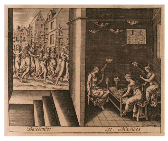
Figure 1. Bacchantes – Les Minéides. Illustration de Les Métamorphoses d'Ovide. Modified from Jean Mathieu, graveur; Ovide, auteur du texte. Editeur: veuve Langelier (Paris) – 1619.

Bats are recognized as important reservoirs of different families of viruses, most of which are emerging as human pathogens, such as Ebola and Marburg viruses, Severe Acute Respiratory Syndrome (SARS) and Middle East Respiratory Syndrome (MERS) coronaviruses. More than 200 viruses have been associated with bats, and almost all are RNA viruses probably owing to their great