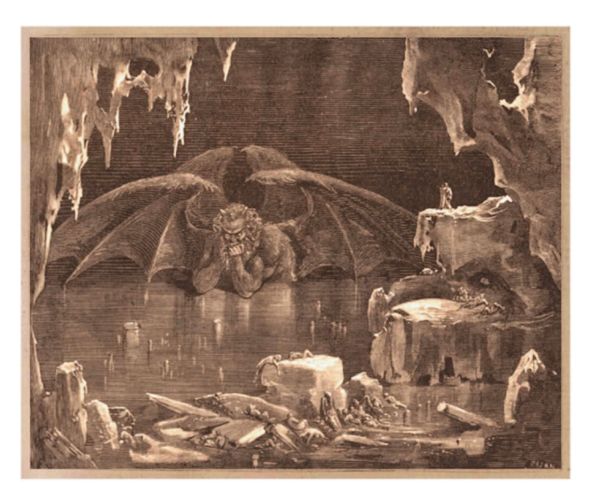
Figure 2. Satan. Modified from Dante Alighieri's Inferno from the Original by Dante Alighieri and illustrated with the designs of Gustave Doré – 1861.

Hendra virus (HeV) causes a fatal respiratory disease in both humans and horses. <sup>20,22</sup> Several outbreaks of HeV have occurred in Australia. Horse is the intermediate host and the virus is likely transmitted via ingestion of feed, pasture or water contaminated