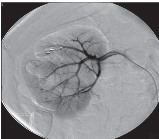
Figure 4: Postangiogram renal angiogram

Glanzmann's thrombasthenia (GT) is one of the rare autosomal recessive bleeding syndromes. [1] It affects the megakaryocytic lineage and is characterized by a lack of platelet aggregation, due to quantitative and/or qualitative abnormalities of \alpha IIb \beta 3 integrin, which is a receptor that helps in aggregation of platelets at the site of any endothelial injury. [2] Glanzmann first described this disease in 1918 as "hereditary hemorrhagic thrombasthenia". [3] It is a relatively more common platelet function defect in communities in which consanguineous marriages are more frequent. [4]