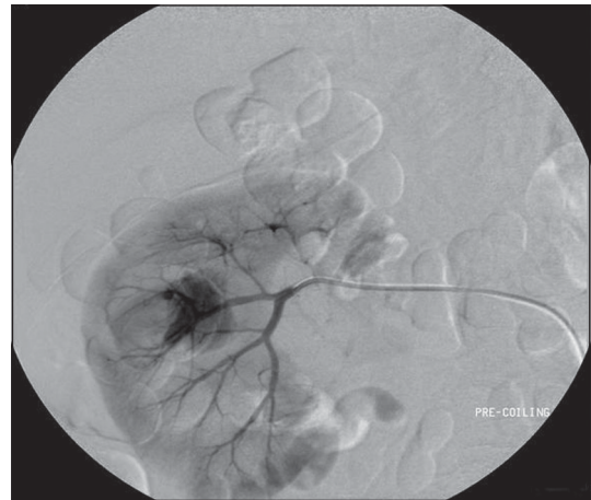
Figure 3: Renal angiogram confirming the ruptured artery

further confirmed by a conventional angiogram [Figure 3]. Hematuria settled after angioembolization [Figure 4].