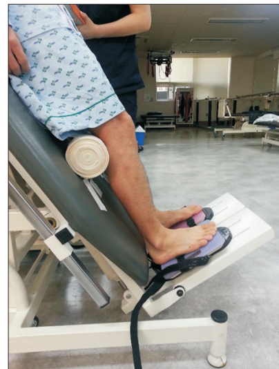
Fig. 1. Unilateral knee flexion posture during tilt table standing.

A tilt table and two simple digital weighing scales of 0.2-kg unit with zero-point-adjustment function and result-