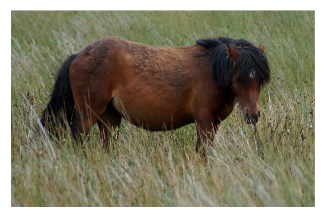
Figure 3. Coat/skin condition achieved very good reliability between observers. Picture is a subadult with poor coat quality taken August 2020. This particular band had to be monitored for an extended period of time due to significant time grazing in marshy area, with tall grasses that prohibited view of limbs for wounds/swelling, mobility, and hoof quality.