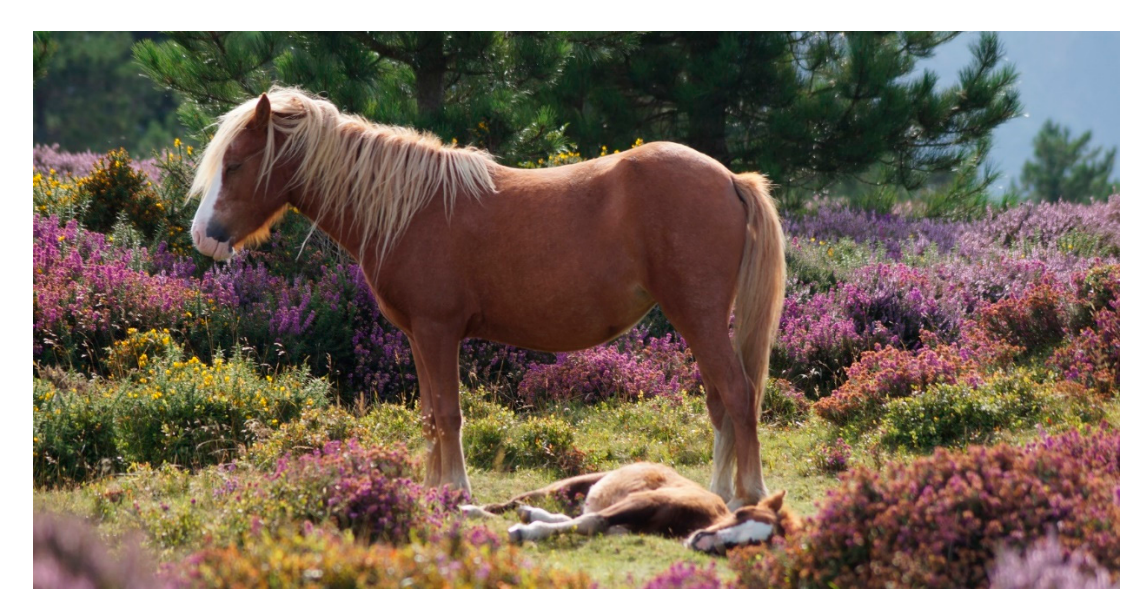
Figure 1. Carneddau pony mare with foal at foot. The image illustrates the difficulty of accessing hoof shape. Patches of grass are surrounded by heather ( Calluna vulgaris ) and gorse ( Ulex europaeus ).

not practical for a rapid welfare assessment in a free-roaming habitat. Therefore, it was not included in the list of RB indicators for nutrition, and the focus was placed on BCS as the primary AB indicator for nutrition. Hoof shape was feasible in-range, but it was also a time-consuming indicator, as the ability to quantify this required extended focal observations; therefore, this was only included as a second level requirement if the pony's mobility was impaired (Figure 1). Fecal samples were opportunistically observed, and despite not having a time limit for observations, waiting for a pony to defecate could potentially add considerable time to an individual pony observation. For those ponies that did defecate, feces were easy to score and collect without moving into a pony's flight zone. Pictures were taken of defecating ponies along with landmarks (e.g., protruding rocks and vegetation) in proximity to the fresh feces. Photos were then used to locate feces and assess fecal consistency.