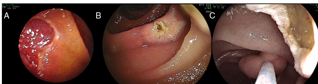
Figure 3 Polyps <15 mm in size were removed en-bloc (A). EMR differs from standard polypectomy in the depth of resection. Whereas during standard polypectomy the polyp is resected near its base at the mucosal level (B), during EMR a deeper resection ensues (C). The injection of submucosal substance ("submucosal cushion") allows for a deeper and likely safer resection (A and C).

in patients with inflammatory polyps as perforation is a likely occurrence in these types of lesions and also not indicated (13). Polyps were divided into those <10 mm and those >10 mm. Polyps <10 mm in size were removed en-bloc (Fig. 3), whereas large polyps (>10 mm) were removed using the piecemeal mucosectomy technique (Fig. 4). The resected specimens were captured with the snare itself,