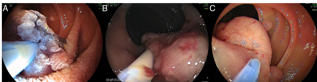
Figure 2 The submucosal cushion serves many purposes: (a) it raises the lesion making it more visible (A), it lifts up the lesion from hiding folds (B), (c) it separates the lesion from the deeper mucosal layers potentially decreasing the risk of perforation during snare resection (C).