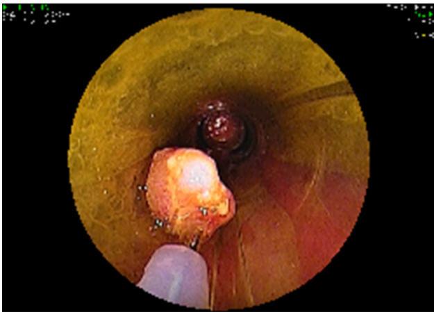
Figure 5 When performing piece meal mucosectomy all pieces of the resected lesion were removed through the overtube.

small bowel EMR, carefully describing the endoscopic technique, which may be useful to avoid complications. It is well known that resection of small bowel polyps is associated with higher risks of perforation or bleeding when compared with polyps from other parts of the luminal GI tract. The complications rate associated with small bowel polypectomy can be as high as 5%. 10,11 Thus, careful utilization of the submucosal cushion and piece-meal EMR technique should be used for flat or broad-based lesions. Furthermore, judicious use of epinephrine is mandatory as there are case reports of small bowel necrosis. 11 Spiral enteroscopy is another deep enteroscopy technique that allows for therapeutic interventions. Whether its usefulness for endoluminal resections has advantages over DBE or SBE is unknown. We also believe that small bowel interventions should only be performed by a therapeutic endoscopist who also has undergone dedicated training in small bowel techniques. In our opinion, the endoscopist performing small bowel resections should be an expert colonoscopist. Unfortunately, there is not a minimum number to decide who can perform this or not. To us, it mainly depends on the skill and, more importantly on the concept and understanding that the small bowel is different and much more care should be applied to endoscopic resections here.