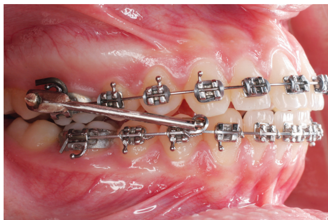
Figure 1 - The Mandibular Protraction Appliance.

The mean MPA treatment time was 9 months in both groups. After removal of the MPA, active retention was provided with Class II elastics to maintain the anteroposterior relationship correction. Gradual decrease in Class II elastics use was conducted in each case, as stability of the anteroposterior relationship was observed.