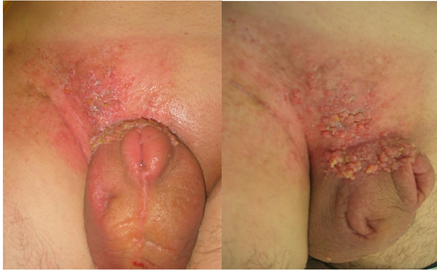
FIGURE 1. Extensive angiokeratoma of the right inguinal region, penile shaft, and scrotum in the distribution of the previous radiotherapy treatment. Also note the scrotal lymphoedema and buried penis.