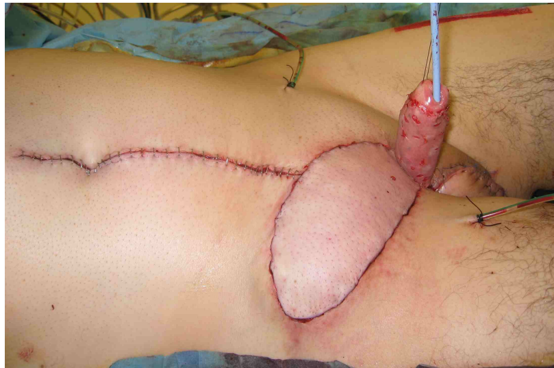
FIGURE 2. Replacement of diseased inguinal skin with a VRAM flap and penile shaft skin with a partial-thickness skin graft.