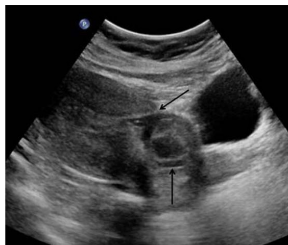
Figure 1 CSP demonstrated by ultrasound.

Ultrasound examinations were performed by color Doppler ultrasound diagnosis apparatus using a 5–9 MHz transvaginal probe (Phillips iU22, GE Logiq 9). Concerning the peritrophoblastic perfusion, both qualitative analysis of spectrograms identifying characteristic blood flow patterns and quantitative variables, including arterial PSV and RI, were detected and calculated (Figure 2). All the data concerning ultrasound parameters included in our research were collected at diagnosis before the treatment of CSP.