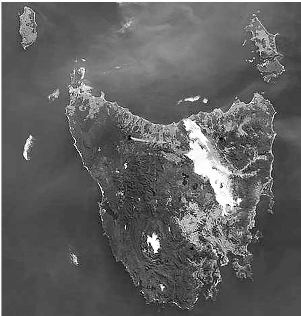
Figure 1 A temperature inversion causing cold air drainage to accumulate as fog in the low-lying areas of the Tamar Valley and Midlands.

period. The latter provided, in effect, a control for changes in disease prevalence and management over the study period unrelated to PM_{10} knowing that Hobart, in Southern Tasmania, has spatially more heterogeneous and rather lower average particle pollution in winter. Hobart is approximately 200 km from Launceston, and shares many similarities in population and weather characteristics.