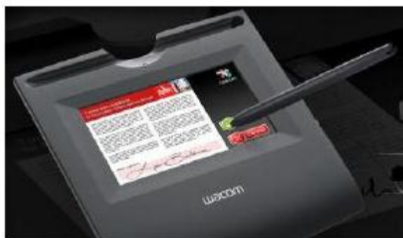
Figure 2: Optical pen and the digital tablet used in this study (STU 520A)

educational levels (from high school diploma to doctoral degree). When the participants drew the shapes (Figure 1) by the optical pen on the digital tablet, STU 520A took their following five features simultaneously: pressure, time, angles with the perpendicular and horizontal axes and velocity.