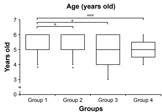
Figure 1 Comparison of age among groups.

Previous investigators have reported that the visually sensitive period in humans is up to 6–8 years of age, 7–10,22,23 and, furthermore, that accurate examination of VA is not possible in children younger than this age range. 24 In this study, however, we recruited 760 children between 3 and 6 years of age and, therefore, visual function may still have