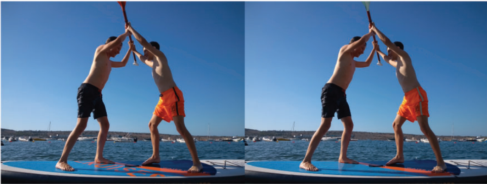
Figure 1. Spot five differences between two pictures.

differences (Grimes, 1996). A better known and far more widely used approach is a flicker paradigm when two photographs are presented intermittently with a brief blank screen in-between (Rensink et al., 1997). What makes this phenomenon so counterintuitive is the sheer salience of the difference once it has been spotted. The discovered change is so obvious that it is hard to understand, why it was so difficult to find it just seconds ago. More importantly, it reflects the limitation of our perceptual and cognitive system rather than the artificial nature of the flicker task (Carbon, 2014). The same blindness to large changes in the environment occurs in naturalistic settings, for example, while talking to a stranger (Simons & Levin, 1998), inspecting the stranger's face (Utz & Carbon, 2020), or even making tea (Tatler, 2001). This implies that we experience change blindness daily (and, most probably, many times a day) but fail to notice it, as there is no experimenter to inform us about it and no solution is provided on the back pages.