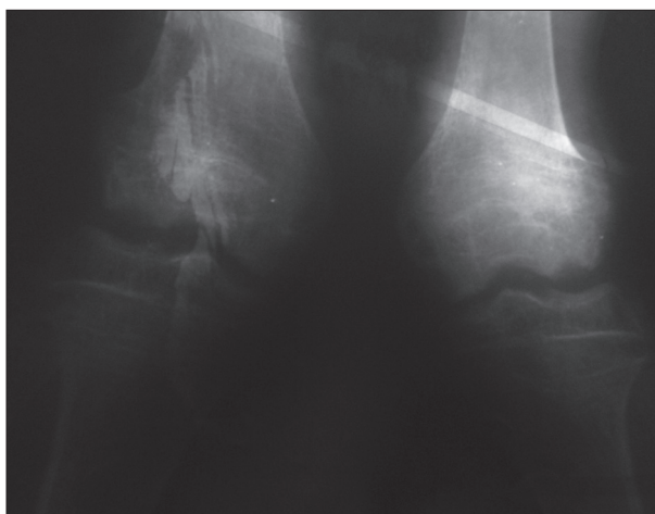
Figure 5: Radiological changes including cupping, fraying, widening of metaphysis, and osteopenia in lower limbs in the patient