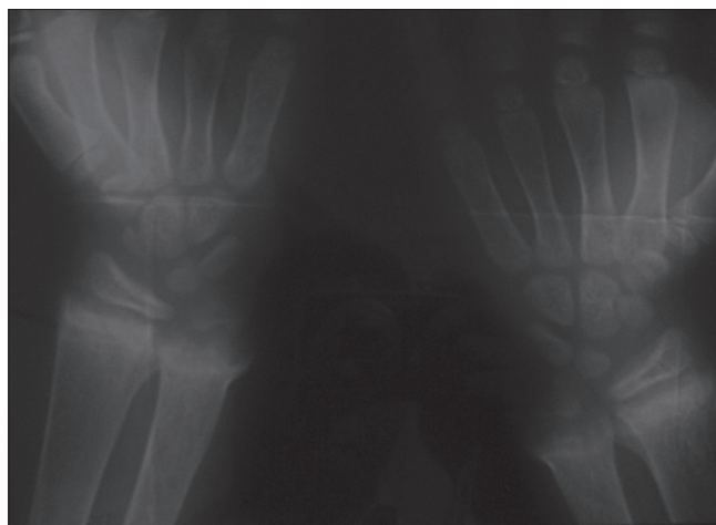
Figure 4: Radiological changes including cupping, fraying, widening of metaphysis, and osteopenia in upper limbs in the patient's sister