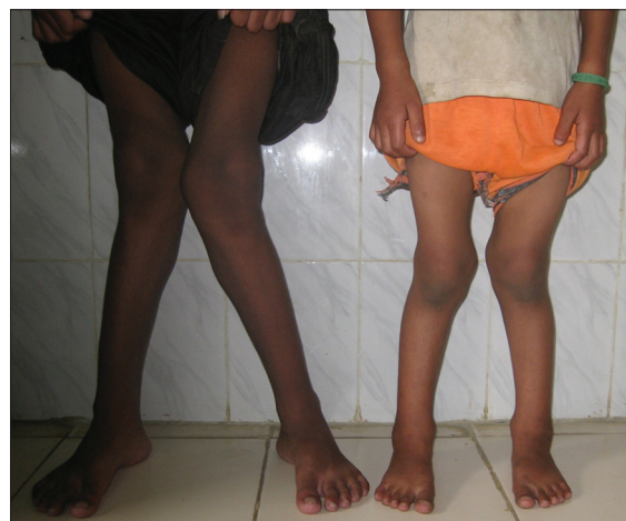
Figure 2: Deformity in the lower limbs in both the cases

Unfortunately the patient refused further evaluation, and it is not known whether the skeletal lesions also responded to vitamin D. Finally, the mode of inheritance of the disorder in our patient is unknown. In fact, it has not been determined whether the defect is hereditary or