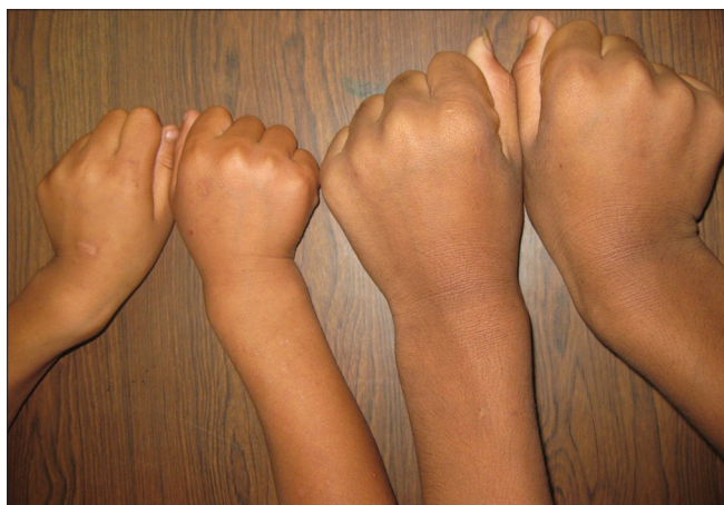
Figure 1: Deformity in the upper limbs in both the cases

Their serum electrolytes and arterial blood gas analysis were within normal range. No abnormalities of fat malabsorption, acidosis, and liver or renal function could be demonstrated. His parents or other siblings did not show any clinical, radiological, or biochemical abnormalities suggestive of rickets.