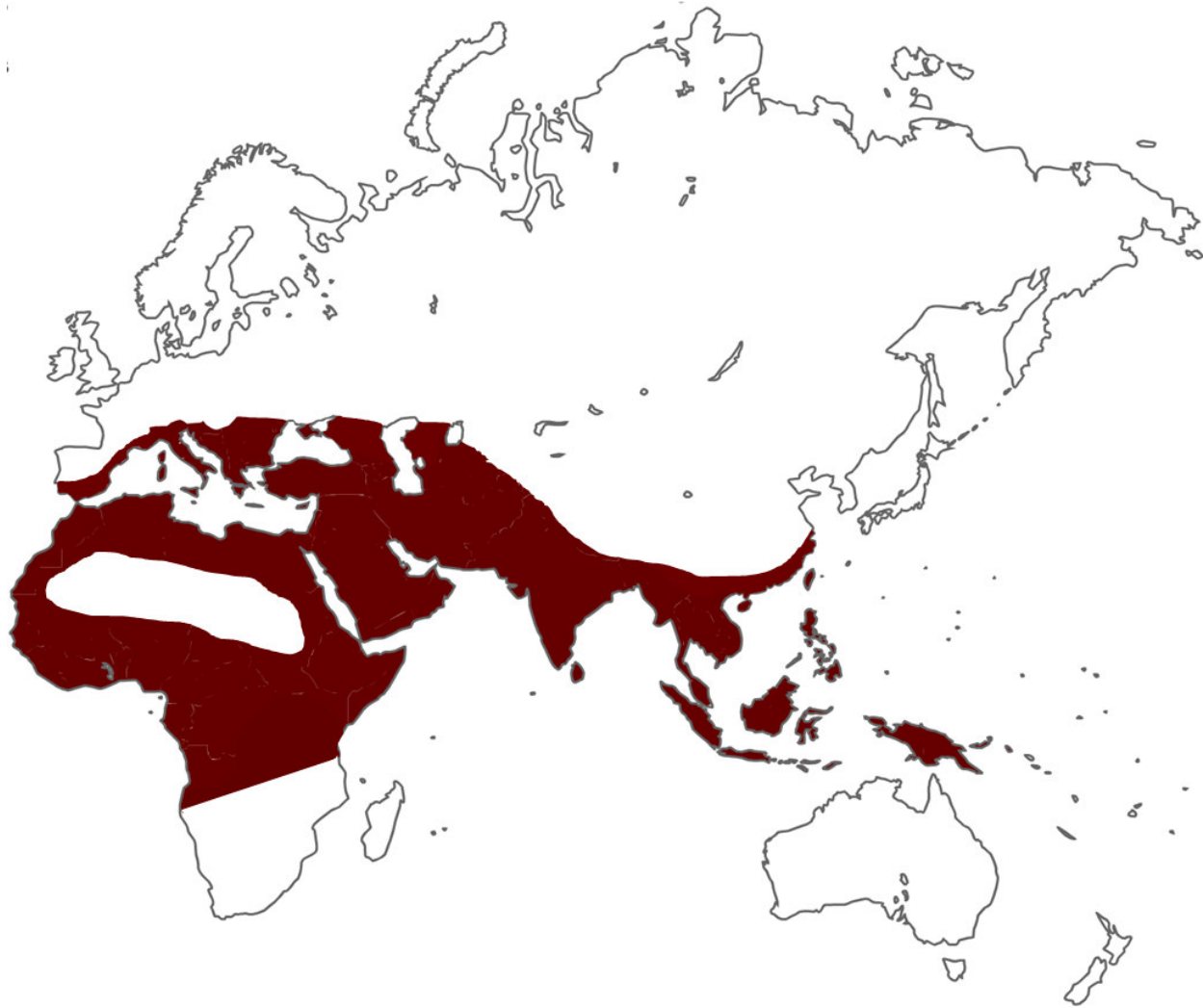
FIGURE 1. World distribution of \alpha -thalassemia. Affected locations are represented by dark red areas (■).

In the clinical setting, improved screening methods, along with better management, have underscored the different patterns of \alpha -thalassemia and diagnosed complications that were previously less well recognized[6]. As technology improved, successful attempts to treat fetuses and infants affected with \alpha -thalassemia major, generally considered fatal, have been reported.