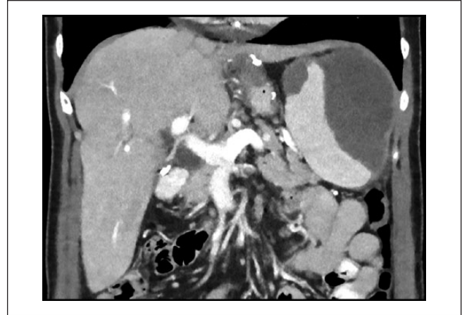
Figure 2. Computed tomography scan of the abdomen illustrating a large splenic heterogeneous subcapsular hematoma and peripancreatic stranding, coronal plane.

A high index of suspicion is required to promptly diagnose this type of injury following ERCP. Although abdominal ultrasound scan has been used, CT scan is still considered the test of choice to investigate any suspected severe complication and