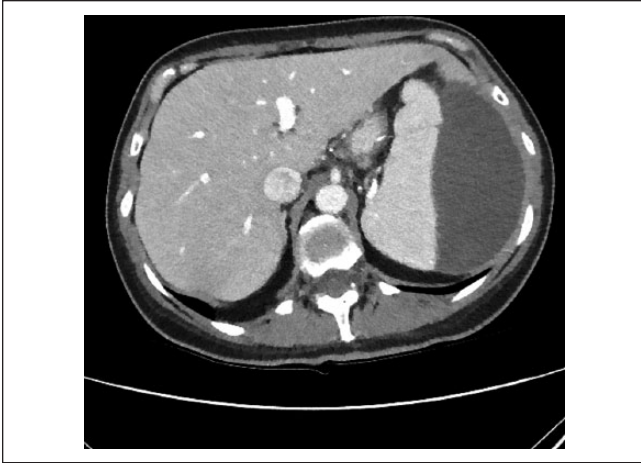
Figure 1. Computed tomography scan of the abdomen illustrating a large splenic heterogeneous subcapsular hematoma and peripancreatic stranding, transverse plane.

peripancreatic stranding (Figures 1 and 2). The patient was transferred to the intensive care unit and managed conservatively with fluids and blood transfusions. The hematoma regressed, and her hemoglobin remained stable. With clinical improvement, she was discharged home.