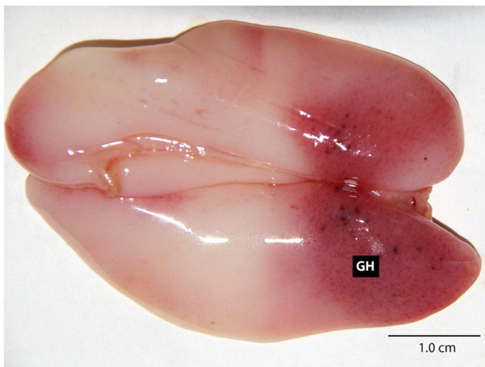
Fig 1. Internal view of the (A) coelomic cavity and (B) gonad of a male Chrysophrys auratus (38.5 cm TL) that was angled from 32.5 m and had a ruptured swim bladder (RS—1.3 cm) and posterior gonad haemorrhaging (GH). The location of the gonad haemorrhage was typical across all fish with this clinical sign. This fish also had a prolapsed cloaca, organ displacement and liver, kidney and coelomic cavity haemorrhages.