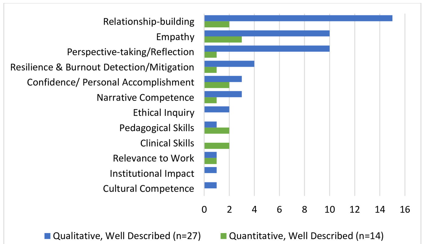
Figure 2 Competencies evaluated in narrative medicine (NM) programmes in systematic review. Results of some evaluations were not well described, not mentioned or not statistically significant. Thus, not all results in online supplementary appendix 2 are included in the description of positive NM programme outcomes discussed in the text of our review.

Table 1 summarises the descriptive statistics of all 55 programmes included in our review. The programmes