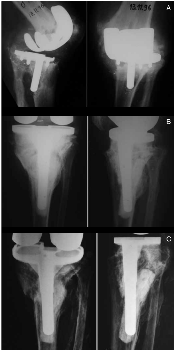
Figure 1 – (A) Loosening of arthroplasty with AORI 3 tibial bone loss. (B) Immediate postoperative period after treatment with structural graft and cemented nail. (C) 70 months after the operation: the prosthesis remains stable and without radiolucent lines.

f) Percentage filling of the canal in hybrid fixation: the measurement was made in the AP and lateral radiographic views. In the region of the last 2 cm of the nail tip, we measured the diameter of the medullary canal and nail. We then calculated the percentage of the medullary canal that the nail was occupying. This proportion ought to be at least 70% (12) ;