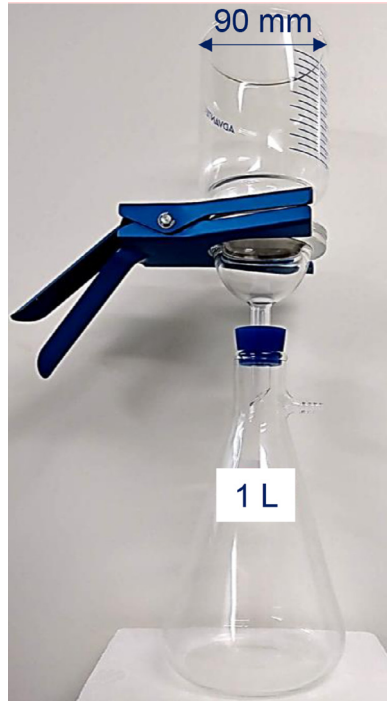
Fig. 1. Vacuum-filtration flask used for particle preparation. This system included a 1 L glass Büchner flask (bottom), a 90 mm diameter stainless-steel filter support housed in a glass base, and a 1 L glass Büchner funnel (top).