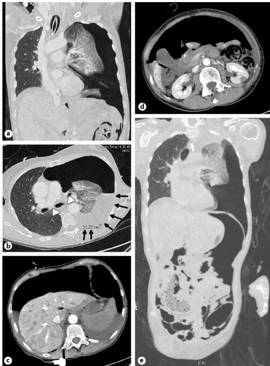
Fig. 2. CT scan of the chest and abdomen demonstrated tension pneumothorax ( a, b ), necrotic esophagus ( b , white arrowheads), necrotic pleural effusion ( b , black arrows) and gastrointestinal perforation with free air in the abdominal cavity ( c, d ). e Frontal reconstruction of the CT scan.