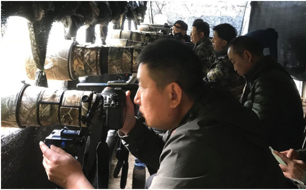
Figure 2. The positive prospects for citizen science in China illustrated by bird photographers in Baihualing, Gaoligongshan, Yunnan Province, in December 2018.

actions, especially in the context of the country's ecological conservation redline policy [13]. A number of priority activities stand out here as necessary to ensure that China's designation of protected areas and other effective area-based conservation measures are, indeed, effectively safeguarding biodiversity.