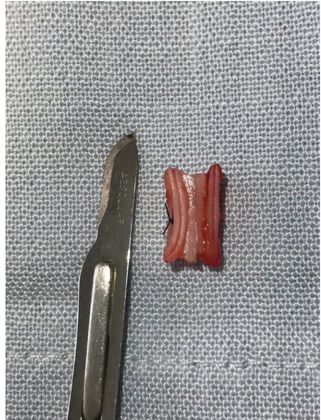
Fig. 2. Cartilage sandwich is prepared using alar cartilage as the outer shell and in the middle the cartilage allograft is located.

At 1-year postoperatively, patients could be seen with adequate nose projection using this allograft (Figs. 3–6).