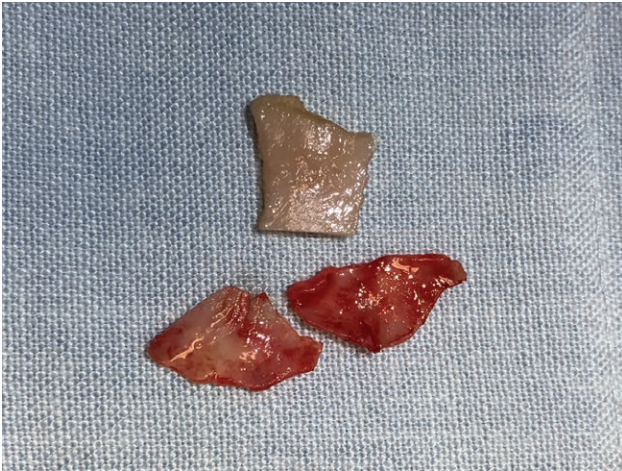
Fig. 1. Allograft cartilage from septal cartilage has a whiter appearance compared with the alar cartilage autograft during surgery.

and HIV before surgery. Cartilage graft is collected in cooperation with the otorhinolaryngology department. After a septal cartilage extraction is done, cartilage is added to a solution containing thiomersal (white merthiolate) in a ratio of 10 to 1. This is later stored in a refrigerated environment at 4 degree Celsius. Cartilages are separated in different bottles depending on the month they were extracted to tell the “age” of it. No cartilage is used after 12 months or before 1 month of preservation to minimize the risk of resorption.