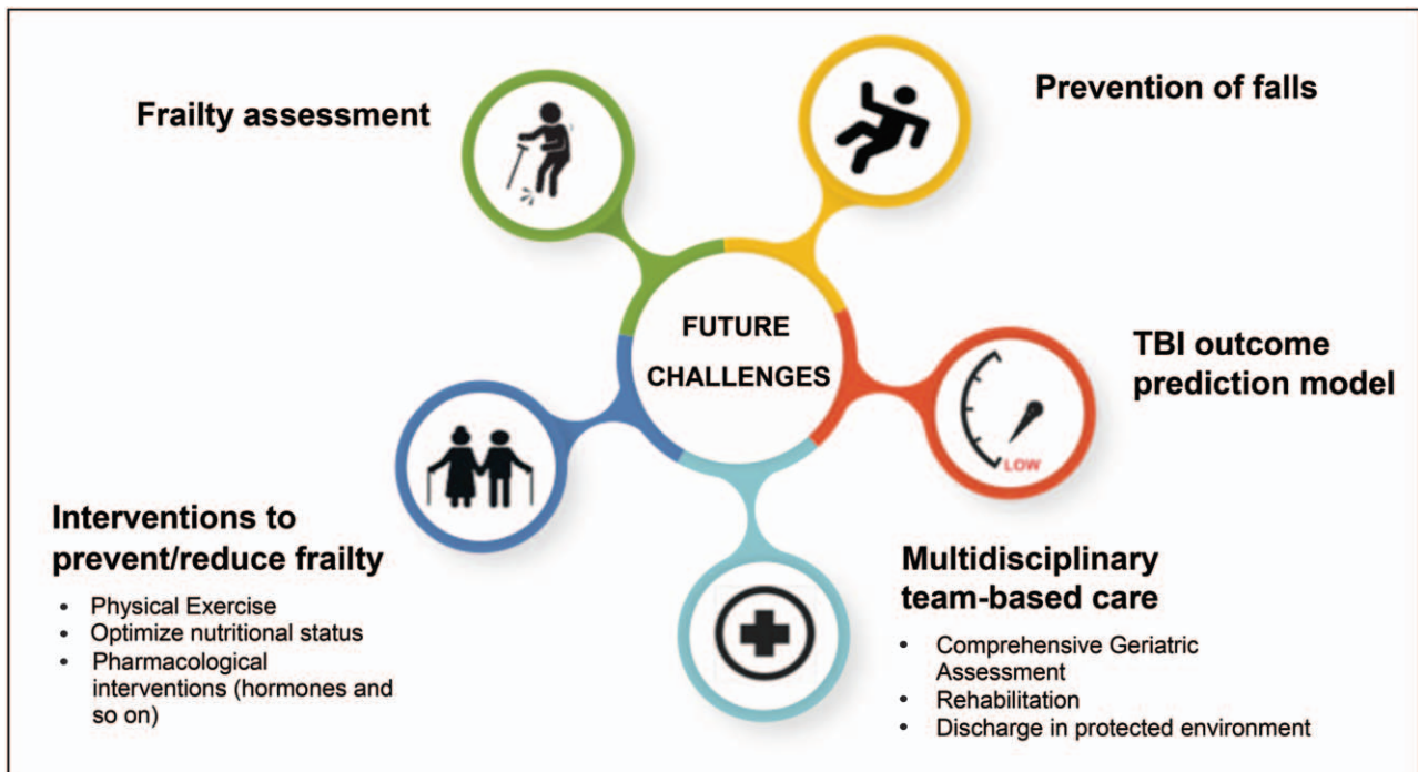
FIGURE 2. Future challenges in each step of evolution of frailty.

prognosis, and response to treatment) necessarily requires personalized strategies [13,14,31 *** ].