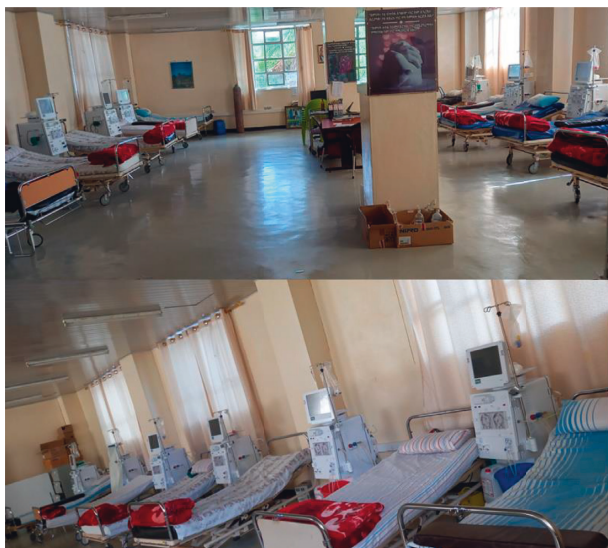
FIGURE 4: A picture of Ayder Hospital's haemodialysis centre displaying empty beds and having no patients connected to the haemodialysis machine due to lack of haemodialysis consumables.

have been saved under normal circumstances have died due to lack of available haemodialysis supplies and central venous catheters.