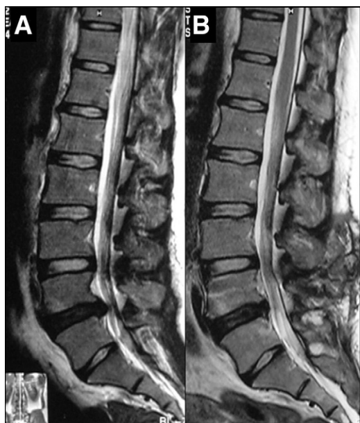
Fig. 2. MRI scans in 38 year-old female patient, showing L5 transitional vertebrae and disc herniation in Carragee group IV. The patient had severe back pain and sciatica. (A) The preoperative MRI scan shows a moderate black disc and diffuse bulging. (B) The postoperative MRI scan after posterior dynamic transpedicular stabilization shows deceleration in the degeneration process.

terior dynamic transpedicular stabilization can be used in segmental degenerative instability to reduce the risk of failed back syndrome or recurrent disc herniation and to decrease the frequency of postoperative sciatica and mechanical low back pain. This seems to be a compelling argument for a new indication for use of posterior dynamic transpedicular stabilization.