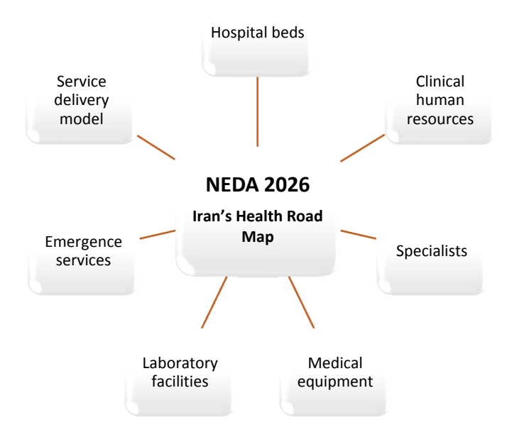
Fig. 1 .Iran's National Health Roadmap Components

and economically viable expansion of hospital beds is the first step in the decision-making process to expand other expensive resources of the health system (5).